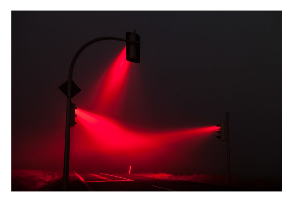
Figure 1: Red lighting: is the post white or red?

Consider the familiar analogy of misleading lighting: an object looks red to us so we conclude that it is red. Once we find out object is being lit with red light, we recognize that we ought to revert to our prior expectations about the object's colour. Information about the misleading lighting screens off the evidential relevance of our perceptual experience to the object's colour.